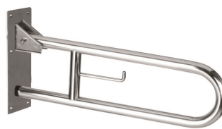
BG0800C Bright finish