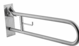
BG0800CS and BG0850CS Satin finish