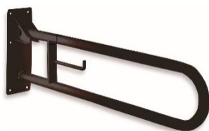
BG2800B Matte black finish