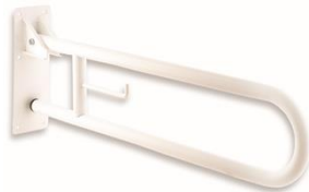
BG2800 White finish