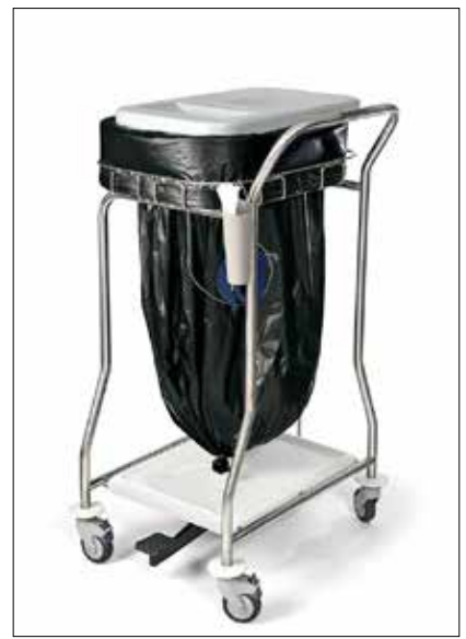
Stand Midi Dynamic UBS