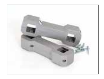
Connector for Longopac Stand Classic Item no. 33750 Connects two or more Longopac Stand products simply and securely. It is