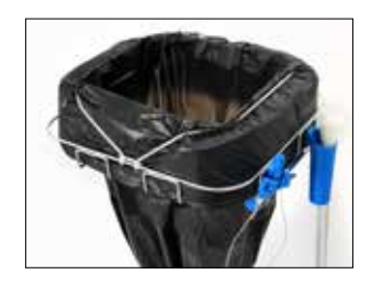
Rubber band Item no. 3102 The rubber band can be used together with all Longopac cassette holders. Effectively locks the cassette in place and prevents it from unravelling.