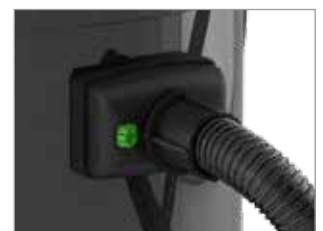
FLEXIBLE HOSE IS LOCKED SECURELY AND RELIABLY