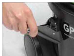
EXTREMELY FLEXIBLE HOOKS