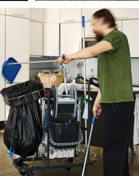
The Longopac system is available in a variety of designs to suit different purposes. Paxxo also offers metal detectable solutions for environments that require it.