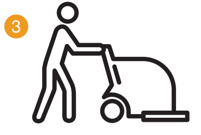
That's it. You are now ready to clean.