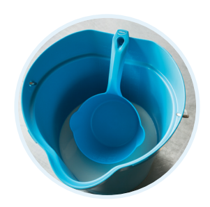
Hanging hook Save time and hassle by storing the scoop inside or outside your Vikan bucket