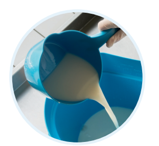
Dual spouts Pour contents easily whether you're leftor right-handed