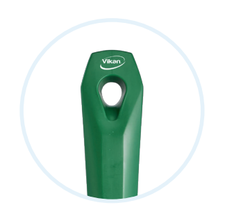
Hanging hole Store on Vikan wall brackets with hygienic drop-shaped hanging hole