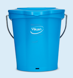
6 Litre Bucket - 5688x Lid for 6 Litre - 5689x