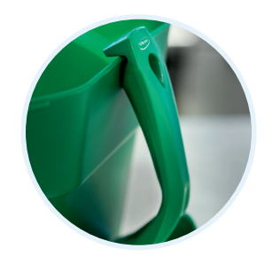
Hanging hook Save time and hassle by storing the scoop inside or outside your Vikan bucket