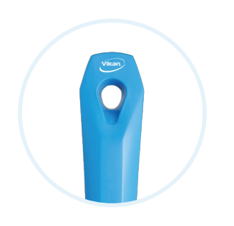
Hanging hole Store on Vikan wall brackets with hygienic drop-shaped hanging hole