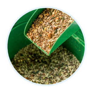
Tight-seal lip Empty containers and scoop ingredients more thoroughly and easily