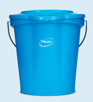
12 Litre Bucket - 5686x Lid for 12 Litre - 5687x