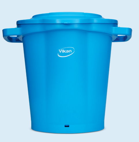
20 Litre Bucket - 5692x Lid for 20 Litre - 5693x