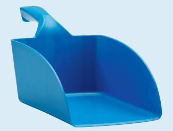
Hand Scoop (2 ltr.) - 5670x