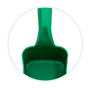
Solid transition Scoop with no flexing and no risk of contaminant build-up