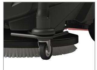
PATENTED TRANSPORT WHEEL